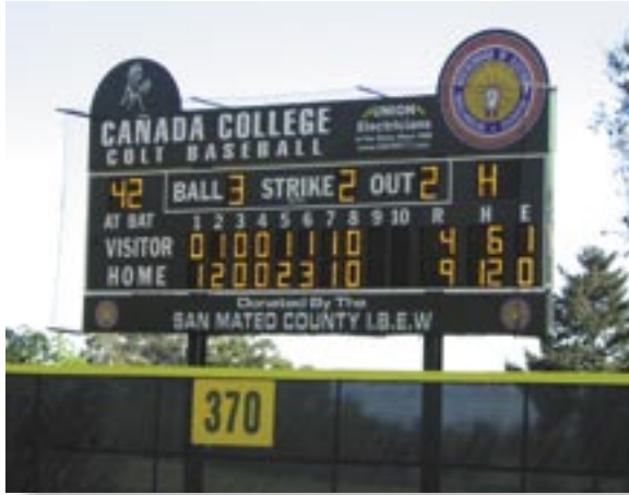
Cañada College, Redwood City, California