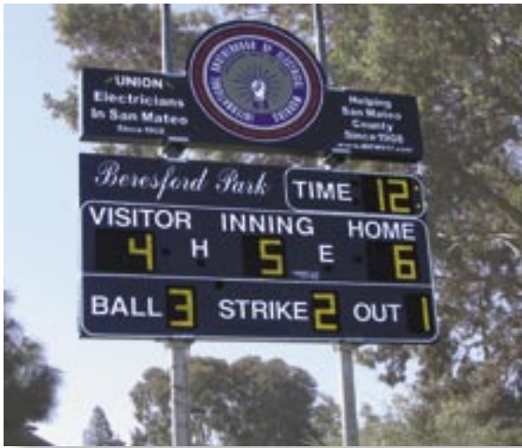
Chanteloupe Field, San Mateo, California