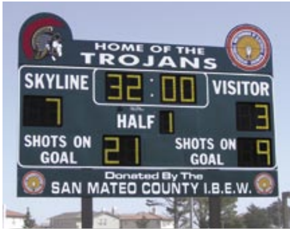
Half Moon Bay High School, Half Moon Bay, California