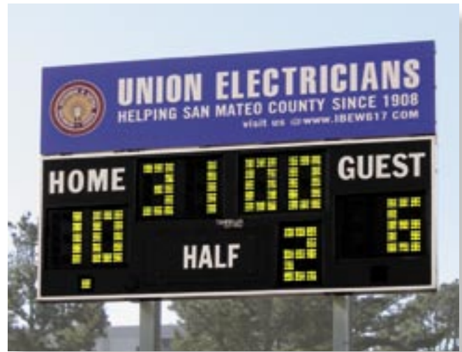
Skyline College, San Bruno, California