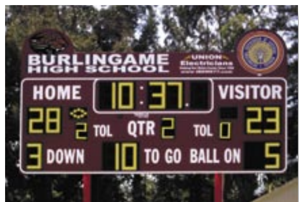
Burlingame High School, Burlingame, California

Up-and-coming union members are growing up right in your own backyard—or playing field. Fair-Play scoreboard sponsorships reinforce the benefits of the skilled trades every day to youngsters and their families making decisions about their future careers. It's a new strategy in apprenticeship recruitment: reaching the students who already know the rewards that come from group effort and teamwork. Sponsor a Fair-Play scoreboard and watch your outreach programs and membership grow!