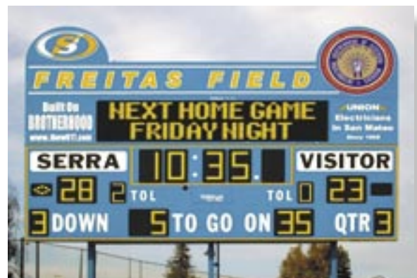
Junípero Serra High School, San Mateo, California

Durable, dependable and trusted—just like your Local. Your union’s initial investment in a quality Fair-Play scoreboard will reap rewards for years to come. Foster community goodwill...create top-of-mind awareness when jobs are up for bid...identify future members to keep your union strong and growing. Sponsor a Fair-Play scoreboard and get in the game!