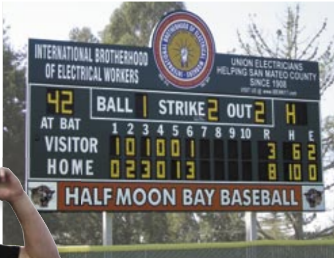
Half Moon Bay High School, Half Moon Bay, California

“THIS YEAR, WE’VE TAKEN OUR ENTIRE TELEVISION BUDGET AND MOVED IT INTO FAIR-PLAY SCOREBOARD SPONSORSHIPS.