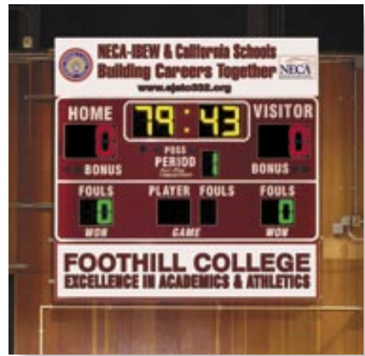
Foothill College, Los Altos Hill, California