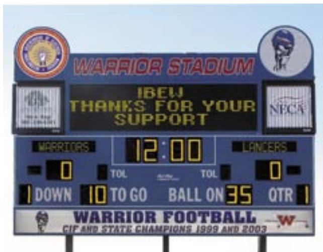
Westlake High School, Westlake Village, California